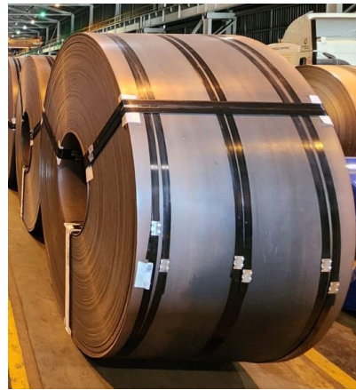
Figure 3: Export strapping