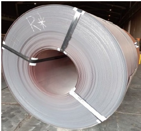
Figure 2: Domestic strapping

Coil axis is horizontal. Coil is without packing material and strapping is with suitable steel strapping (see Figures 2 and 3). Strapping will depend on domestic or export locations. The coil is labelled with two bar code labels, one on either side of the coil.